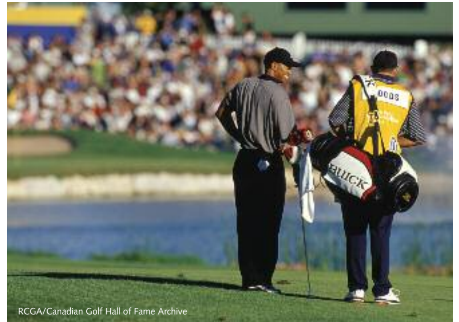
RCGA/Canadian Golf Hall of Fame Archive