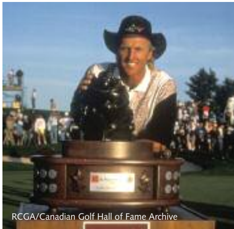
Greg Norman celebrates his 1992 victory, his second Open championship at the Abbey. He also won in 1984.

Greg Norman, Nick Price, Curtis Strange and Bruce Lietzke all captured multiple titles at Glen Abbey, with single wins going to such major champs as Hal Sutton, Steve Jones and Mark O'Meara, who designed Grandview Golf Club in Huntsville.