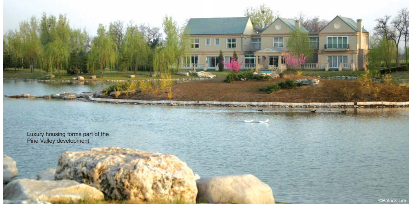
Luxury housing forms part of the Pine Valley development

GOLF COURSE: Jack Nicklaus Signature Course - Par 72, 7259 yards Jack Nicklaus II Links Course – 27 holes (opening soon) LOCATION: Changping County, Beijing, about 60 kilometres west of the Beijing CBD. The 1,000-acre site is close to the famous Great Wall site at Badaling WEBSITE: www.pinevalley.com.cn