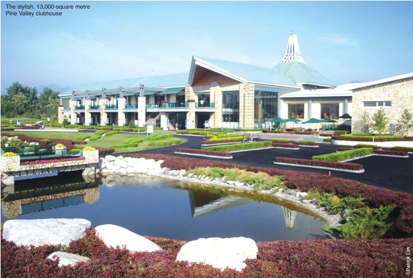
The stylish, 13,000-square metre Pine Valley clubhouse